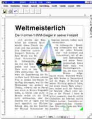
The paper on the Web