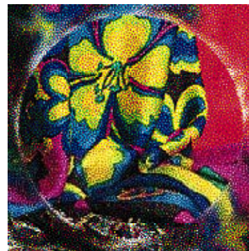
Stochastic Dispersed Screening

If you examine HDS tints closely you will notice that, though no conventional halftone pattern exists, at any given level of tone the tints have a certain 'homogeneous' structure, and that this structure changes smoothly up and down the gray scale.