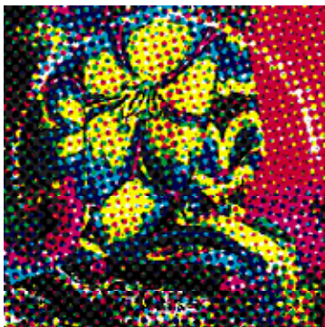
Conventional Halftone Screening

Different coarseness and device resolution combinations can be specified to support a wide variety of output device technologies.